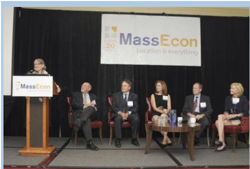
The Annual Conference panelists gearing up to discuss "Manufacturing Transformed"