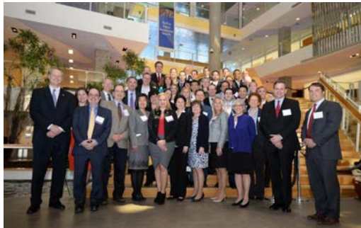
Honorees and Governor Baker at MassEcon's 8th Annual Corporate Welcome Reception

Nominate a Company for the 13th Annual Team Massachusetts Economic Impact Awards