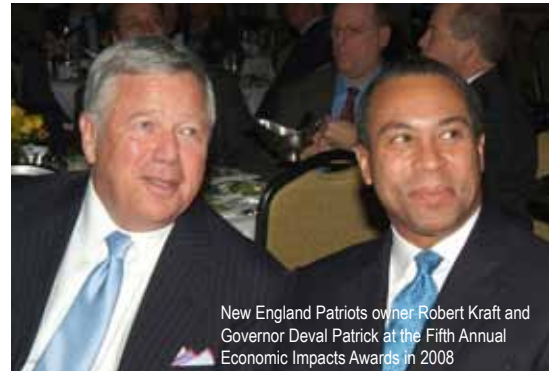
New England Patriots owner Robert Kraft and Governor Deval Patrick at the Fifth Annual Economic Impacts Awards in 2008

1996 Publishes the first Massachusetts Industrial and Research Park Directory in joint venture with NAIOP