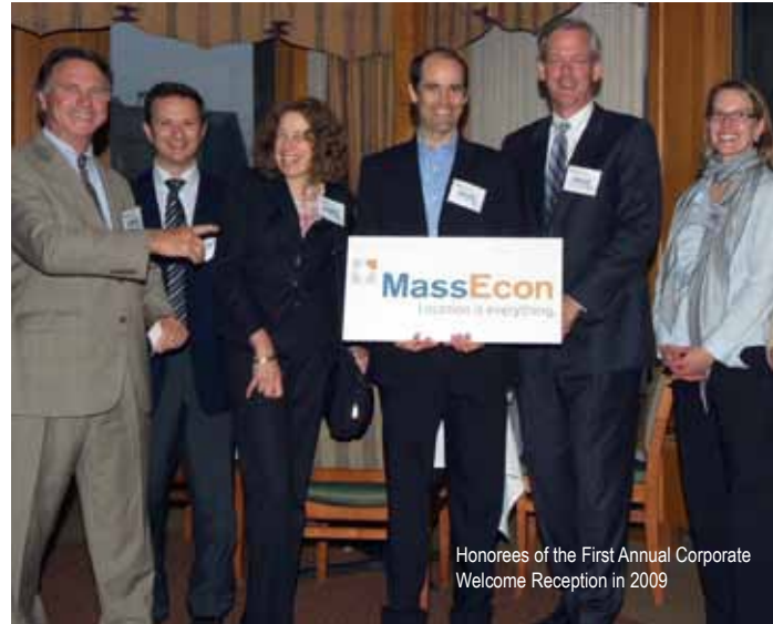
Honorees of the First Annual Corporate Welcome Reception in 2009

2004 Hosts the First Annual Team Massachusetts Economic Impact Awards event in Massachusetts