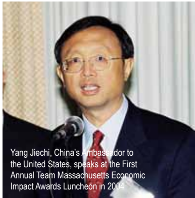
Yang Jiechi, China's Ambassador to the United States, speaks at the First Annual Team Massachusetts Economic Impact Awards Luncheon in 2004

1994 Launches the statewide Site Finder Service