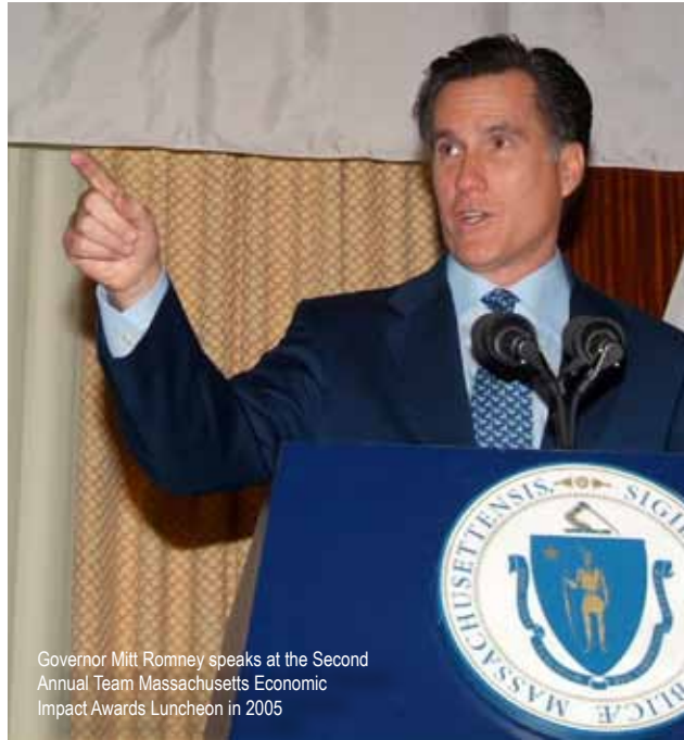
Governor Mitt Romney speaks at the Second Annual Team Massachusetts Economic Impact Awards Luncheon in 2005

1993 The Massachusetts Alliance for Economic Development, then known as MAED, is launched as the state's first public-private partnership to promote Massachusetts as a place to do business