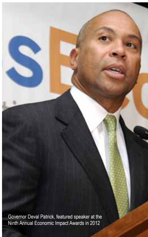
Governor Deval Patrick, featured speaker at the Ninth Annual Economic Impact Awards in 2012

2010 Welcomes national site location consultants to Massachusetts as part of the first-ever ReadyMass initiative, a program showcasing Massachusetts as a premier business location