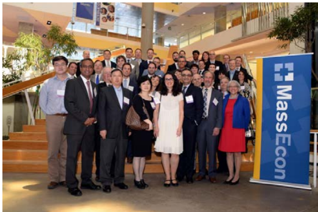
2017 Corporate Welcome Honorees