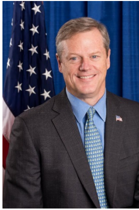
Governor Charlie Baker Featured Speaker Corporate Welcome Reception