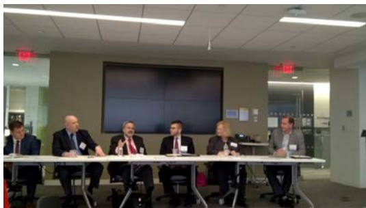
"What's New with Business Incentives in Massachusetts?" Roundtable Panelists

Thank you to Ernst & Young for hosting "What's New with Business Incentives in Massachusetts?" Roundtable