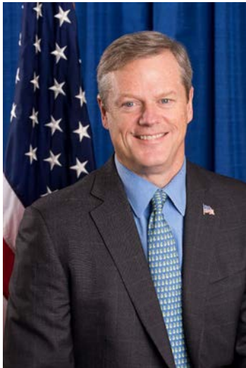
Governor Charlie Baker will be the Featured Speaker at the Corporate Welcome Reception on April 20