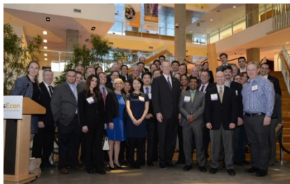
Honorees gathered at Genzyme for the Seventh Annual Corporate Welcome Reception