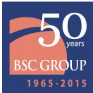
Thank You to BSC Group for Sponsoring the June Annual Conference