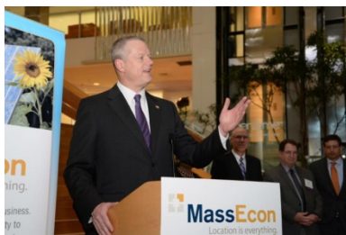
Governor Charlie Baker - Featured Speaker at Corporate Welcome Reception