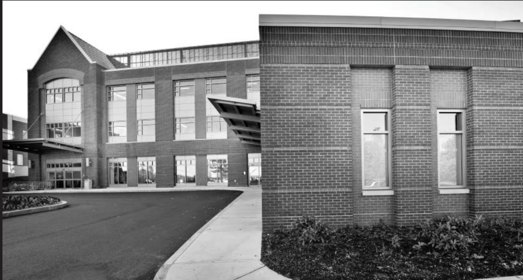
Berry, a Division of Suffolk, wishes to congratulate our partner, Heywood Hospital, on winning the prestigious Community Leader Award.

WE ARE PROUD TO RECOGNIZE THE 2010 MASSECON HONOREES.