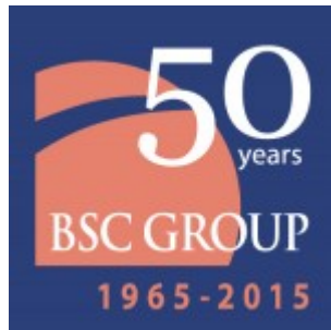
Thank You to BSC Group for Sponsoring the June Annual Conference