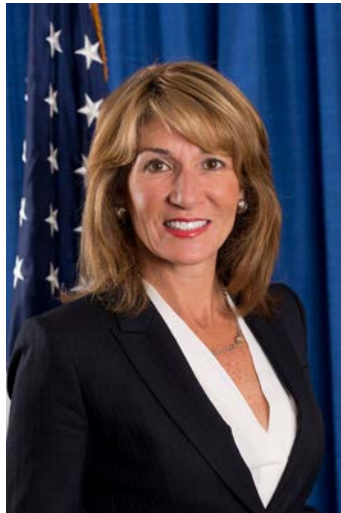
Lt. Governor Karyn Polito - Featured Guest Speaker at Summer Reception