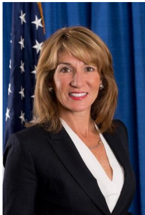
Lt. Governor Karyn Polito - Featured Guest Speaker at Summer Reception