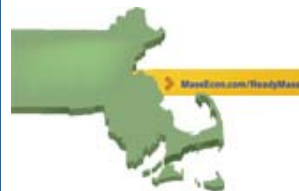
Click the map above to read about the consultants who participated in the ReadyMass On Location visit