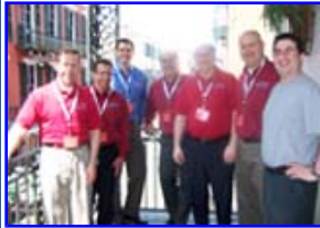
Team New England at CoreNet in New Orleans